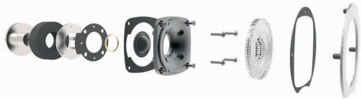
▲ Exploded view of the Debut Line tweeter