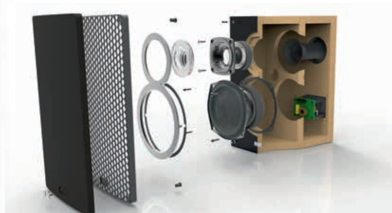
▲ Exploded view of the Debut Line bookshelf loudspeaker